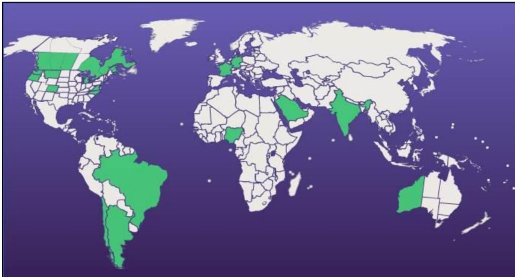
Distribution of Students by Geographical Location